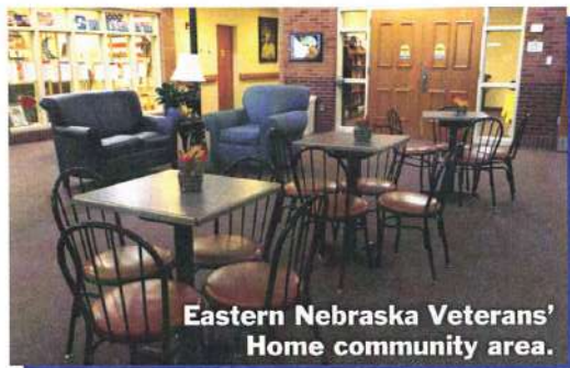
Eastern Nebraska Veterans' Home community area.