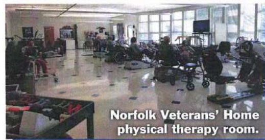
Norfolk Veterans' Home physical therapy room.