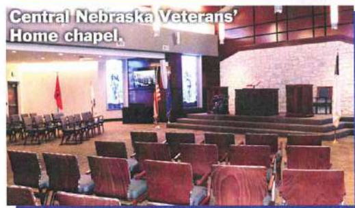
Central Nebraska Veterans' Home chapel.